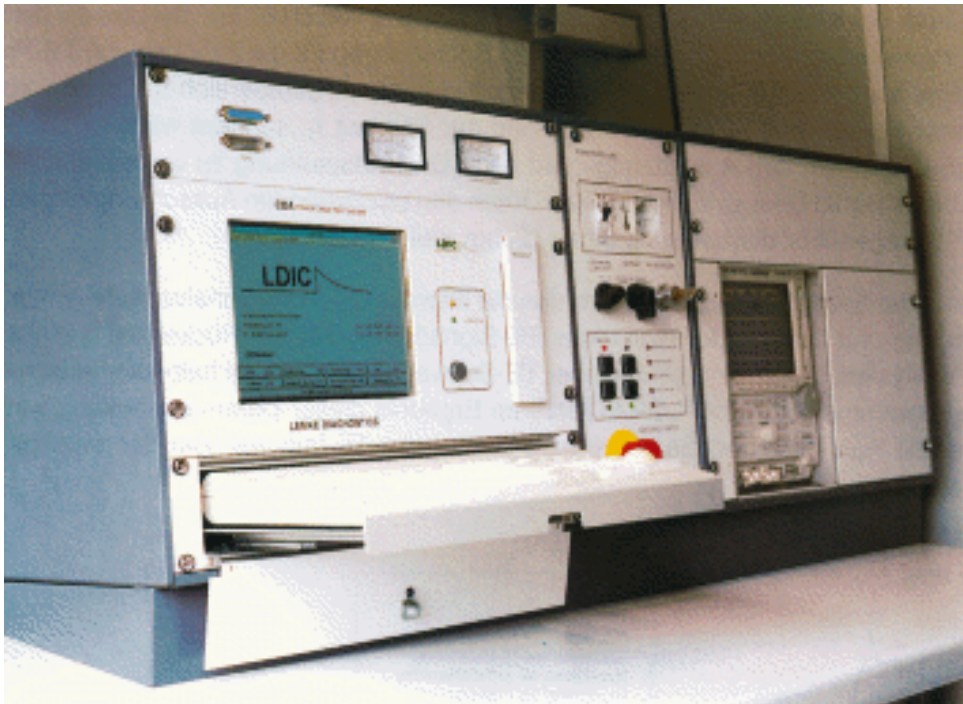
Fig. 1: View of the measuring and control modul of the CDA test facility, installed in a cable test van